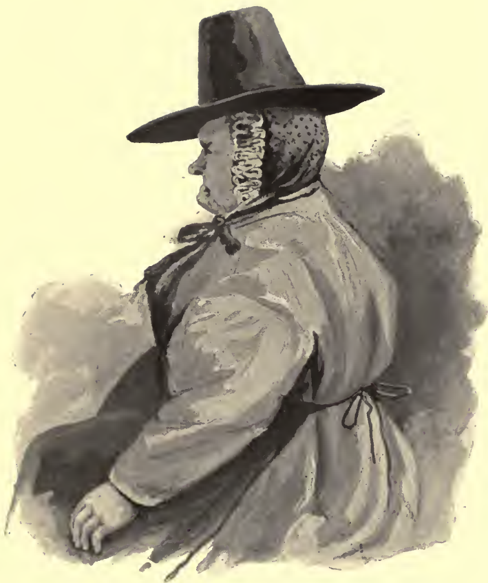
The sextoness of Dolgelly.